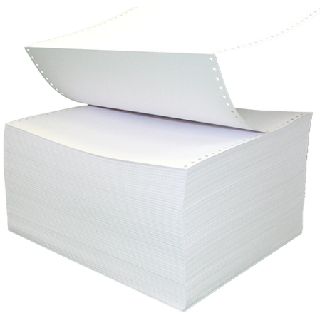
CONTINUOUS / TRACTOR / FANFOLD BRAILLE PAPER

Being the largest supplier of production Braille embossers world-wide, Braillo knows what paper works best, and how to ensure a consistently high quality Braille paper product. Our Braille paper handles the heavy demands of production embossing, and it is used in some of the largest Braille production facilities in the world. Likewise, it also works exceptionally well to meet the lesser demands of smaller, personal-use Braille embossers.