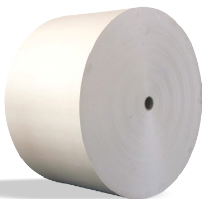
BRAILLE PAPER ROLLS

Customizable Options - We are able to offer customizable products, since all of our Braille paper is processed in house. We can produce all standard Braille paper sizes and punches in Plain, 3 Hole and 19 Hole options; however, we have the capability to provide a wide variety of different colors, sizes and punches.